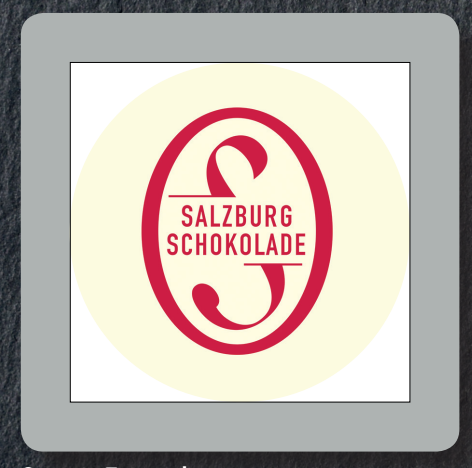
Step 2: Example