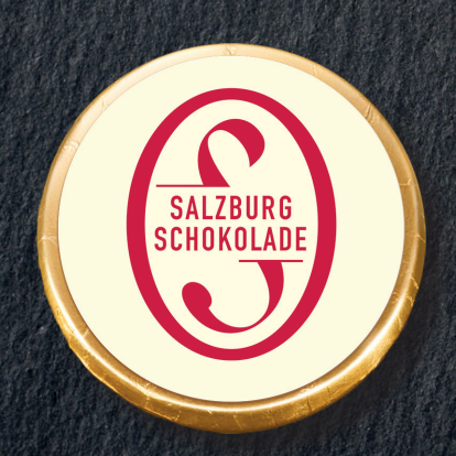
Example for a final product